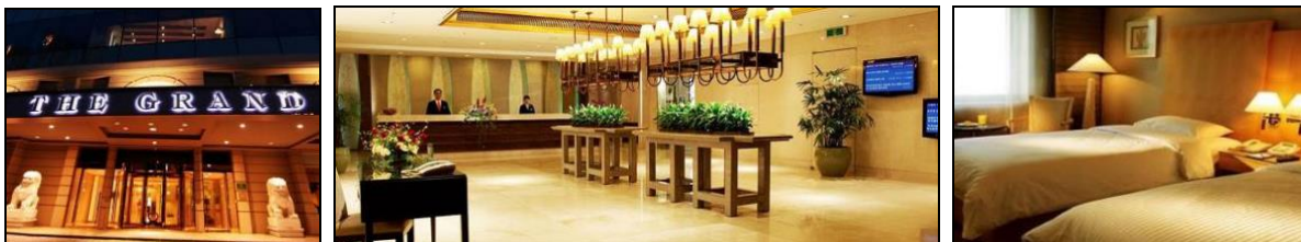
Grand Hotel Daegu