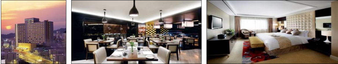
Grand Ambassador Seoul