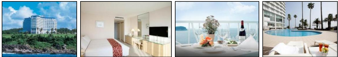
Seogwipo KAL Hotel Jeju Island