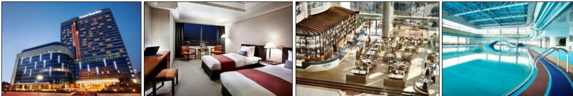
Haeundae Grand Hotel Busan