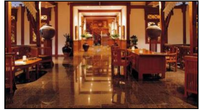
Belmond Governor's Residence Yangon