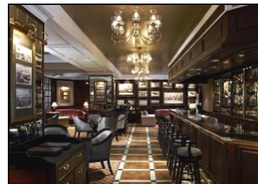
Sule Shangri-la Yangon