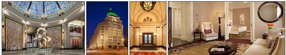
Fairmont Peace Hotel Shanghai