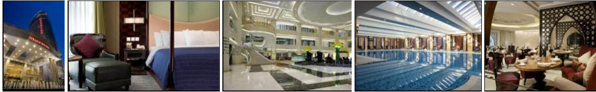
Sheraton Urumqi Hotel