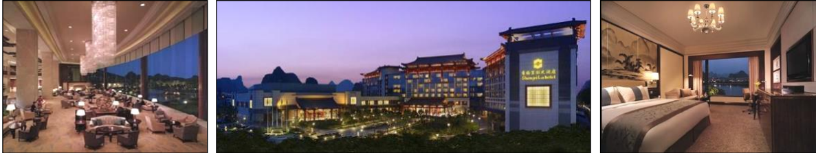
Shangri-la Hotel Guilin