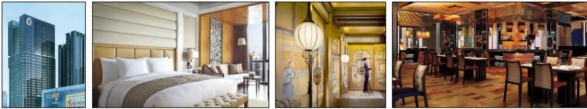
The Ritz Carlton Chengdu