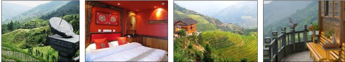
Li'An Lodge Longsheng