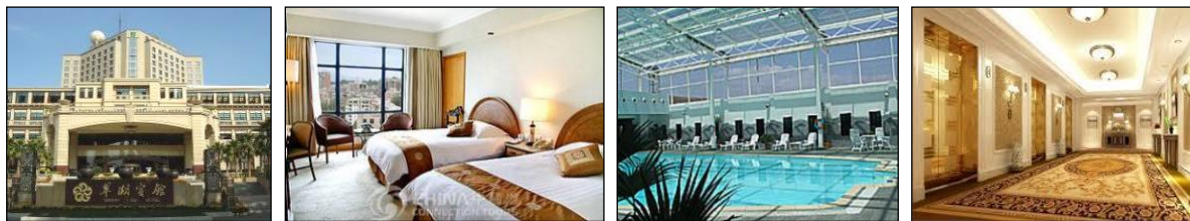
Green Lake Hotel Kunming