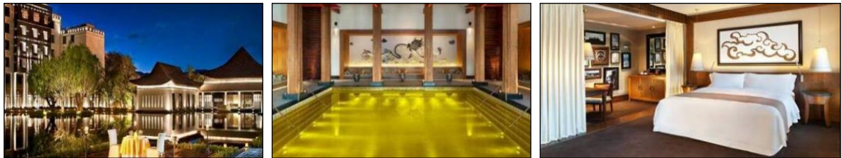
The St. Regis Lhasa Resort