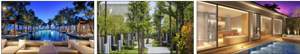
Naman Retreat Da Nang