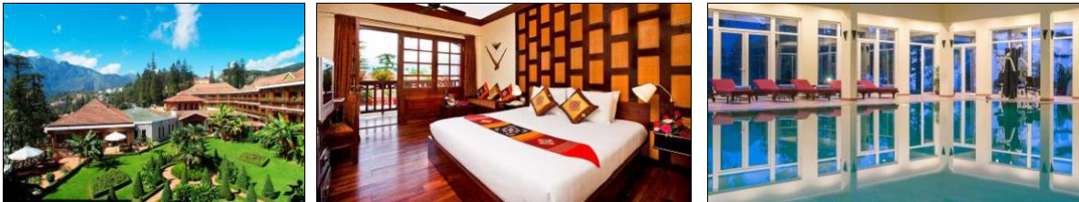
Victoria Sapa Resort & Spa