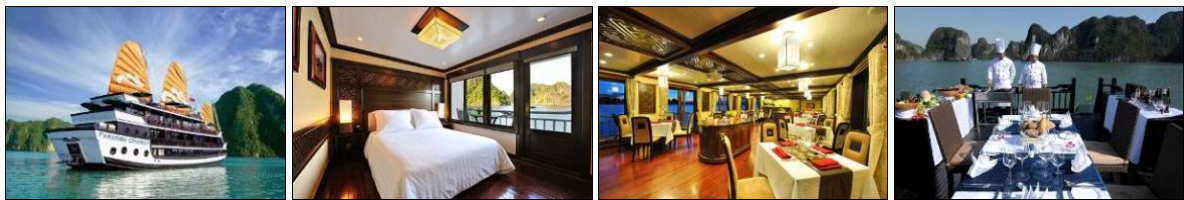
Paradise Luxury Cruise Halong Bay