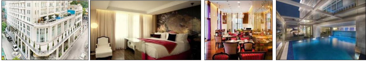
Hotel de l'Opera Hanoi